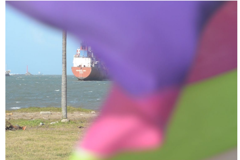
Panamá Caribe , Video stills, Fluid States: Performances of UnKnowing , Colón, Panama, 2015

During a Caribbean sunset, a gesture was performed suggesting a festival overlooking the sea, with synchronised swimming, synchronised festivities and parallel stories.