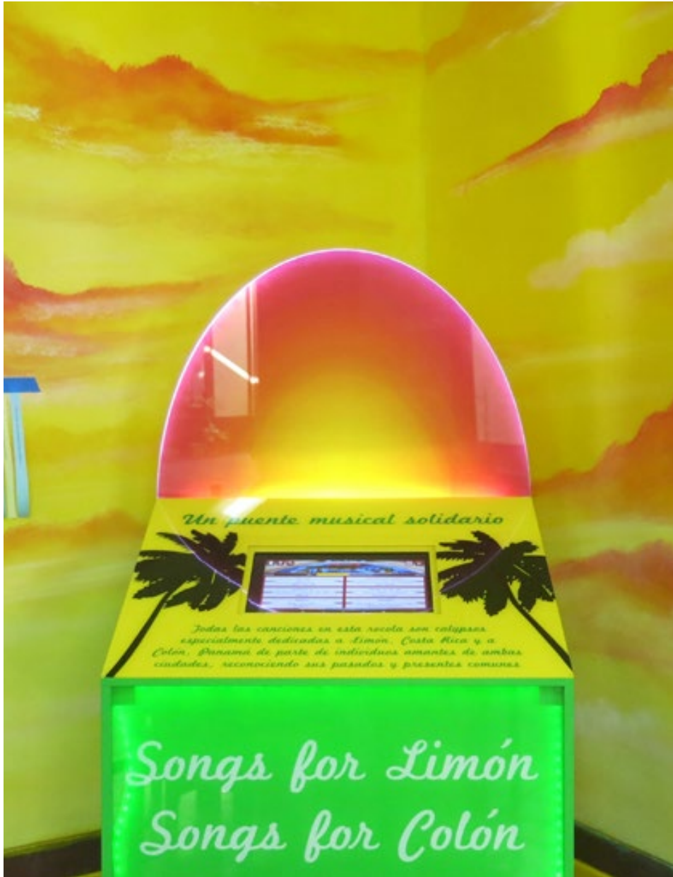
Songs for Limón, Songs for Colón , Installation detail X. Bienal Centroamericana, Limón, Costa Rica, 2016