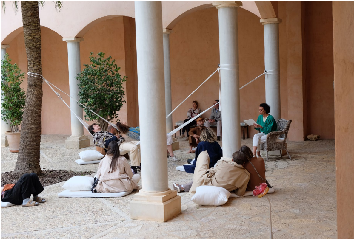
Ocaso Mallorca live reading and lullabies, April 2025, as part of the exhibition HEARTH in CCA Andratx.

To calm the mind, to relax the cells, to stop for a moment the overdose of information; to allow ourselves to find comfort for the great changes in the past and in the future; to mourn the loss of nature.