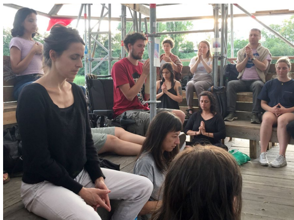
Workshop during the Climate Care Programme at Floating University, Berlin 2019

The e-book and card set have been published in English and Spanish. The workshops have been held in person and online both in English and Spanish.